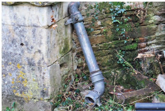
Defective gutters and saturated stonework

1 If interiors are of historic, architectural or artistic interest, seek professional and DAC advice.